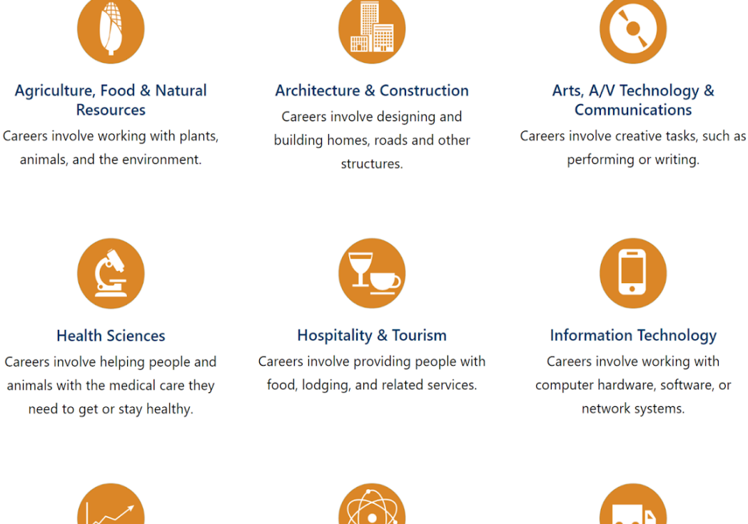
Marketing Careers involve promoting and selling products and services.

Grades 11-12, One or Two Year Programs, Credits vary from 1-4 This program through Northeast Wisconsin Youth Apprenticeship (NEWYA) allows students to explore a future career while earning money, high school credits, and post-secondary credits. Youth Apprenticeship Programs are offered in the areas of: